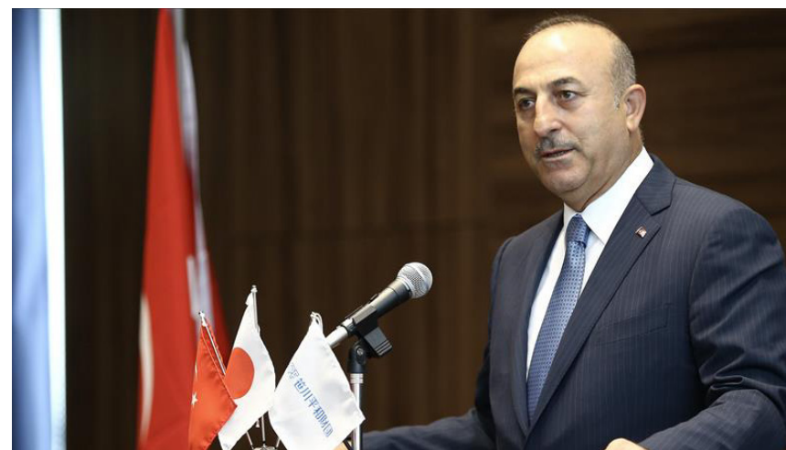
Turkish Foreign Minister Mevlut Cavusoglu speaks during a session titled: 'Recent Developments in the Middle East and Turkey's Role' following his meeting with the honorary chairman of The Sasakawa Peace Foundation, Yohei Sasakawa during his official visit in Tokyo