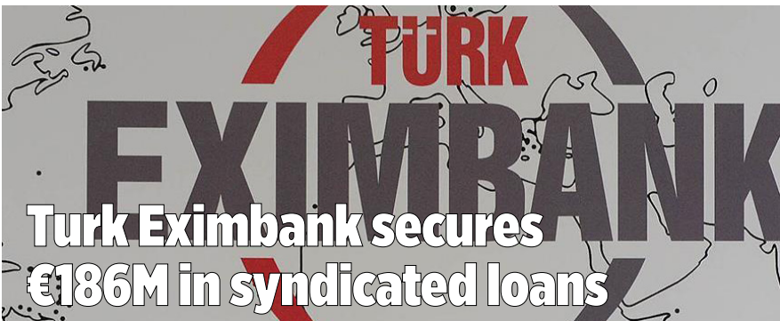
Türk EXIMBANK Turk Eximbank secures €186M in syndicated loans