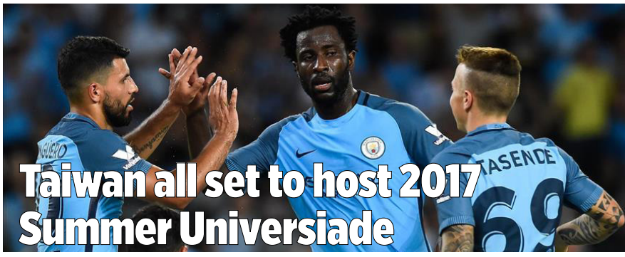
Taiwan all set to host 2017 Summer Universiade