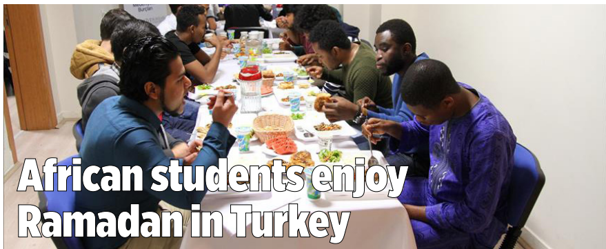
African students enjoy Ramadan in Turkey