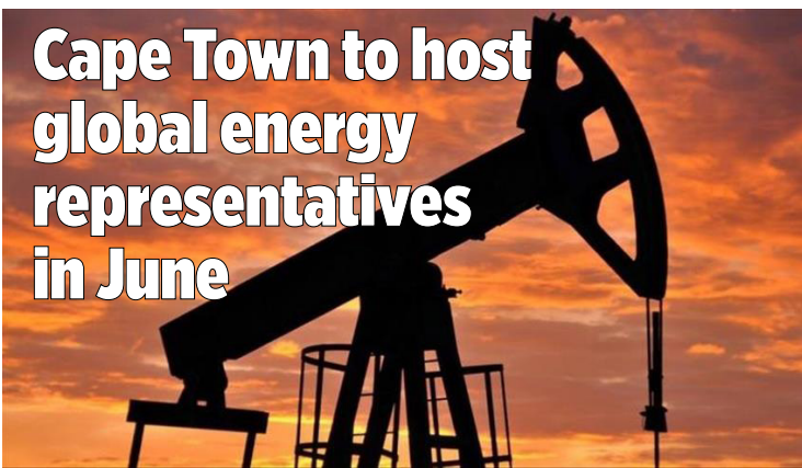
Cape Town to host global energy representatives in June

The Square by Sweden's Ruben Ostlund wins Palme d'Or