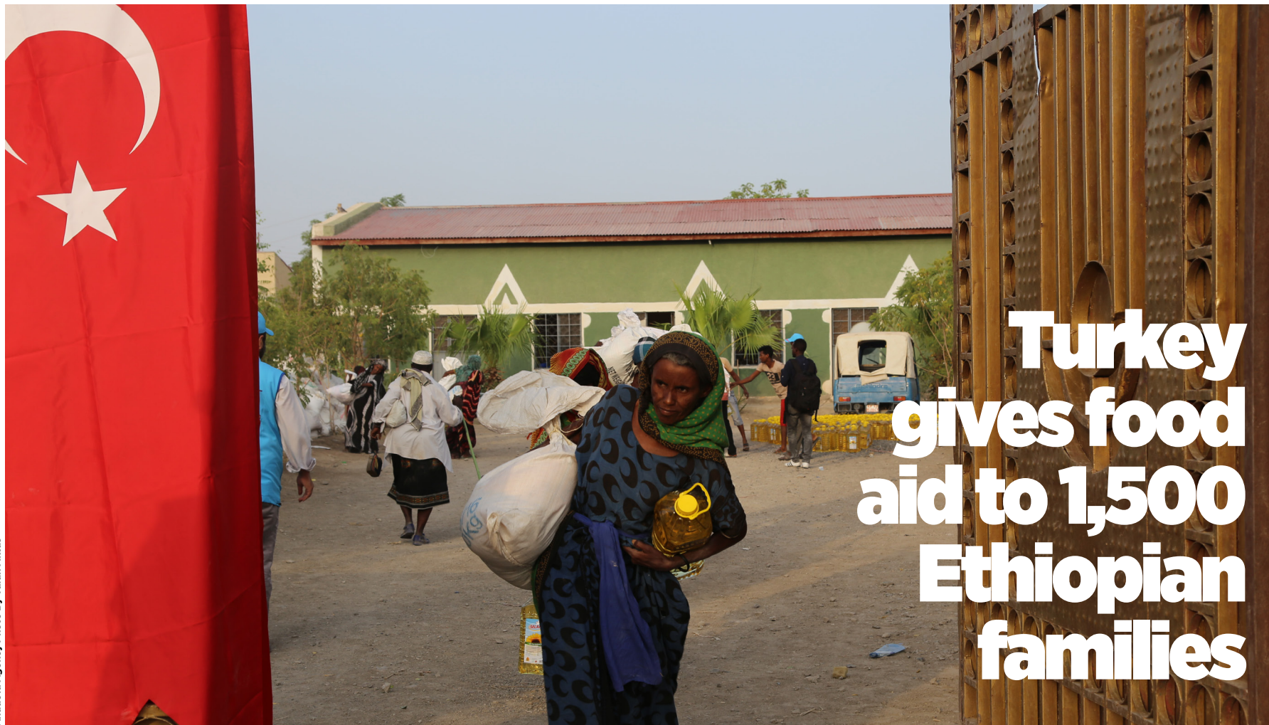
ETHIOPIA, AFAR - MAY 28: An Eritrean woman receives food supply from a man who works for Turkey's Diyanet Foundation, in Afar province of Ethiopia

"The conquest of Istanbul, which is regarded as one of the most important milestones of world history in terms of its social, cultural and political consequences, is a victory full of lessons for us and for all humanity," Erdogan said. In addition, Turkish Prime Minister Binali Yildirim issued a statement to mark the anniversary of Istanbul's conquest. "The conquest of Istanbul has set a new direction for the world history in terms of political, social... MORE DETAILS